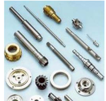
Swiss Machine Screw Parts