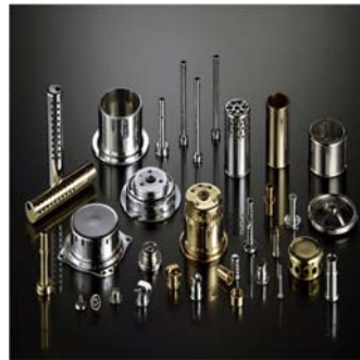
Deep Draw Parts