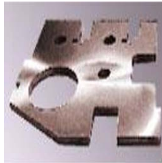
Flame Cut or Sawed Parts